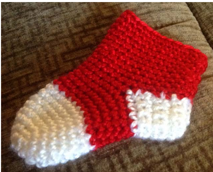
Section Four Complete