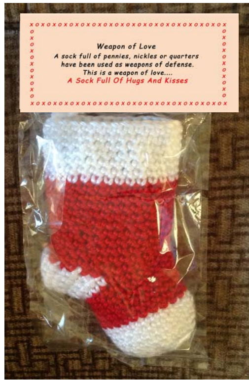
The Finished Project Back