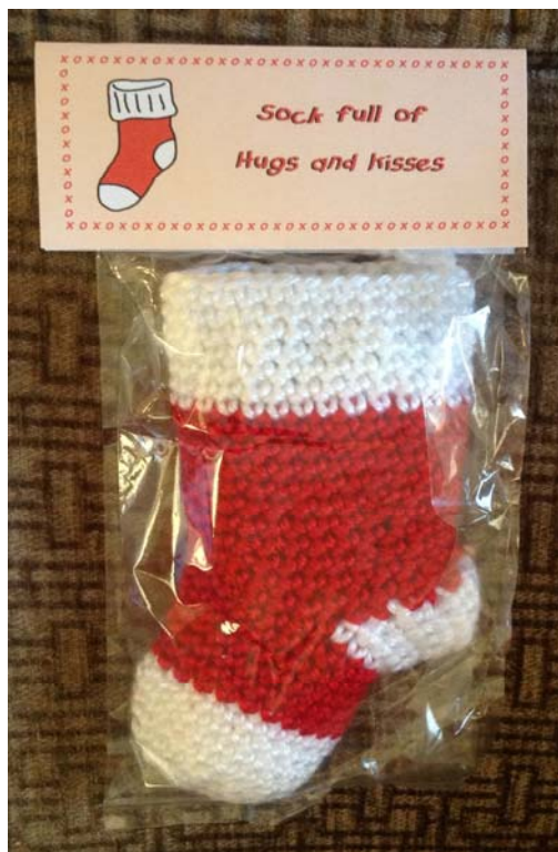
The Finished Project Front