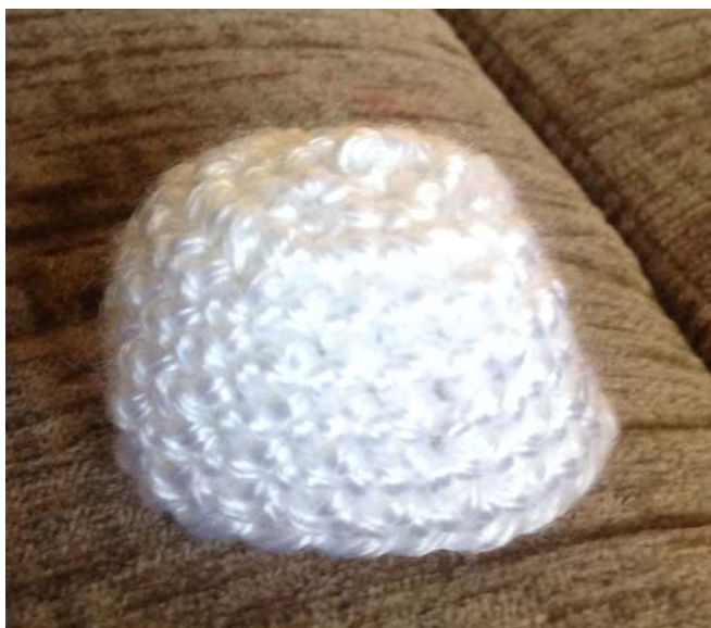
Section One complete