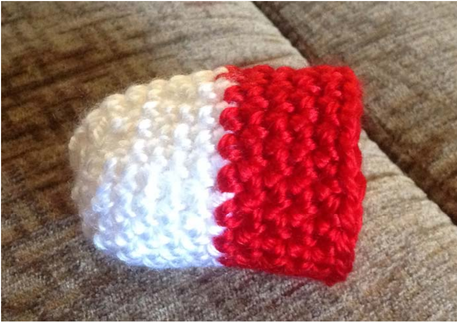
Section Two Complete