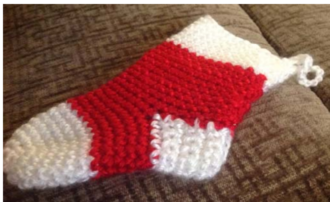
The Finished Stocking