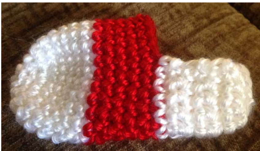
Section Three Complete