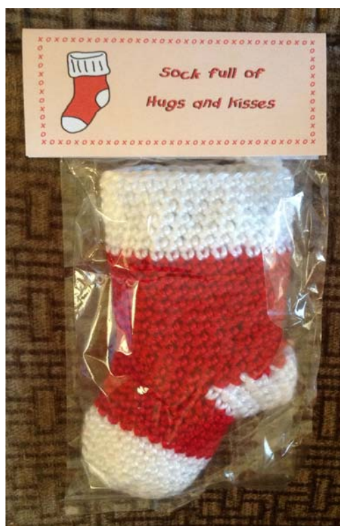
The Finished Project