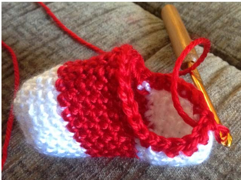
This is how it should look After Row 21