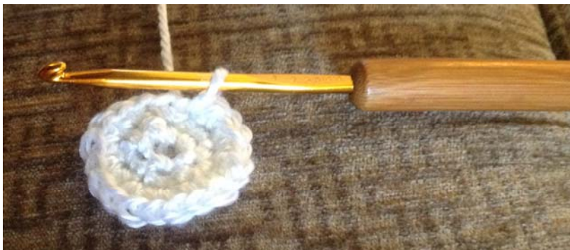
What it should look like After Row 3